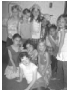
Above shown is a group of Grade 2 performers in CBC's