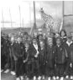
The Grade One's at the Giraffe House

They learnt a lot about different animals and saw how tall a giraffe really is.