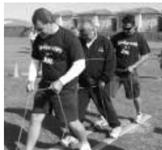
Afrikaans Day being enjoyed by one

“Whatever your hand finds to do, do it with your might.”