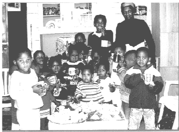
Some children in the Du Noon community enjoying the sandwiches donated by